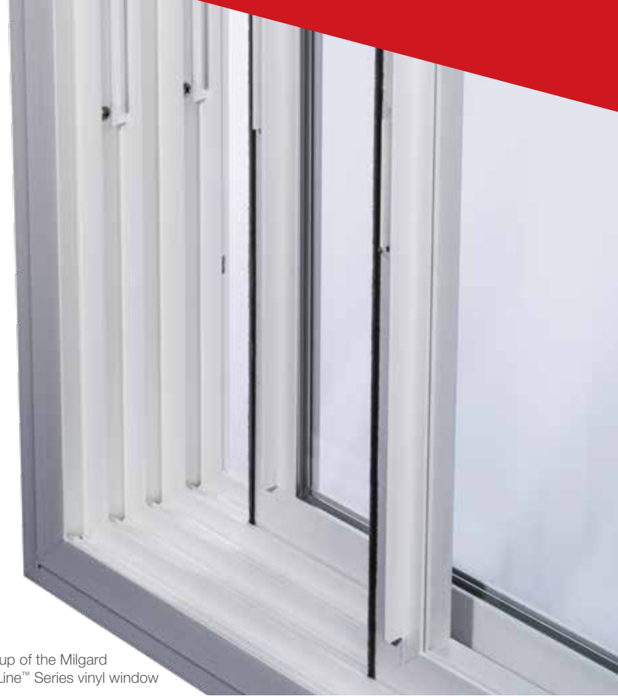
Close-up of the Milgard Quiet Line™ Series vinyl window

Usually when sound control is the focus a specific STC requirement is the target. Using our STC rating chart, identify the noise sources you most frequently hear in your home, then choose the type of window necessary to reduce those noise types. Consult a Milgard Dealer for more information on the window type best suited for your particular needs. It's that easy.