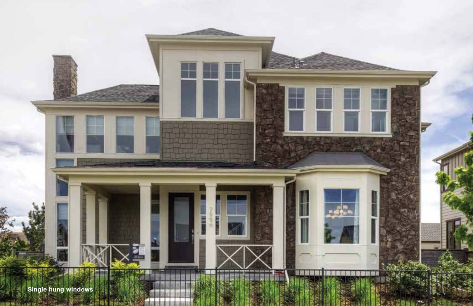
Single hung windows