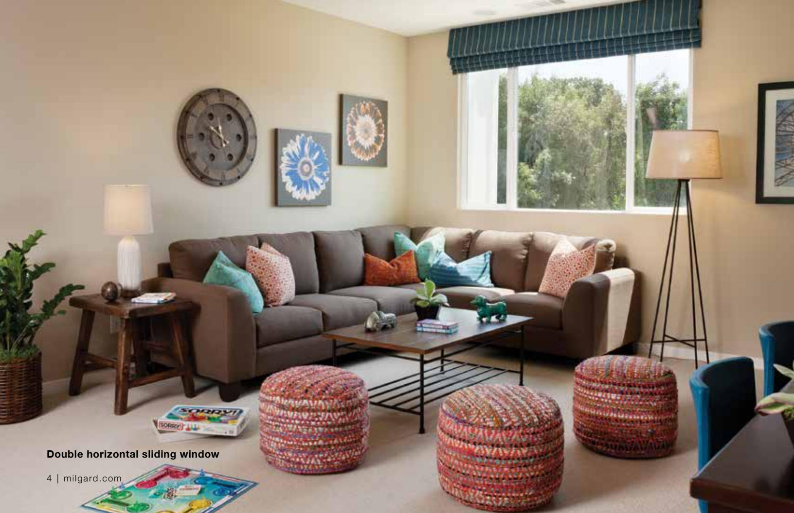
Double horizontal sliding window