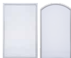
PICTURE AND RADIUS

Awning windows are hinged on top and open outward, enabling ventilation without letting in rain or falling leaves. They are a great choice to pair with non-operable windows, such as above or below a picture window.