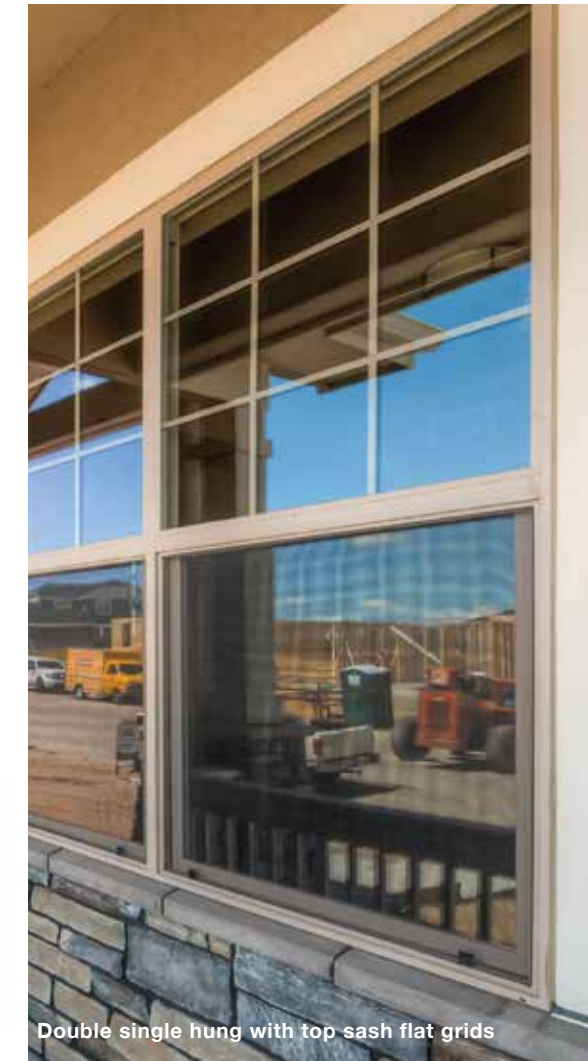
Double single hung with top sash flat grids