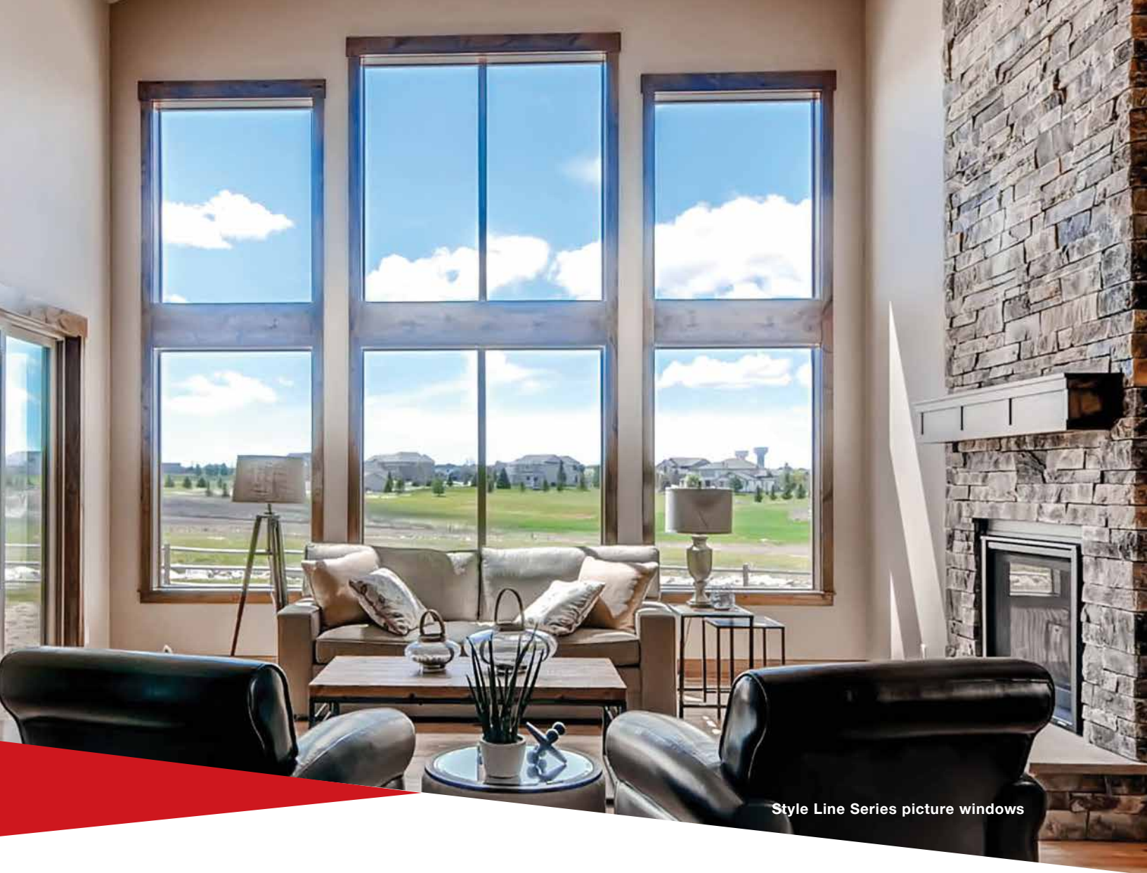
Style Line Series picture windows